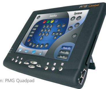
UI device shown: PMG Quadpad

Stardraw Control – the fastest, most cost-effective solution for system control